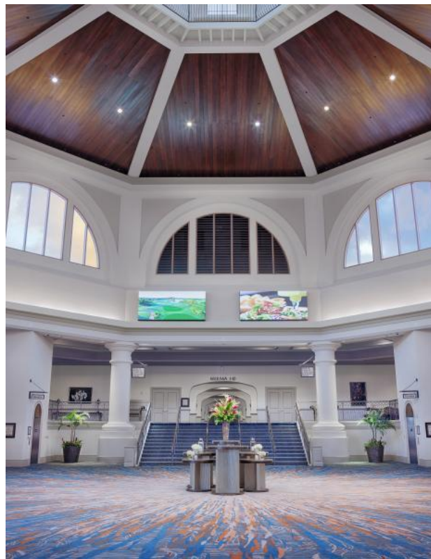
The recently enhanced rotunda inspires with vibrant new carpeting and impressive views.

As an independently-owned collection of accommodations in Orlando, Rosen Hotels & Resorts - the parent company of Rosen Shingle Creek - is uniquely situated to react quickly and decisively to ensure that planners have all that they need for a thriving event. It is what planners have come to call The Rosen Difference .